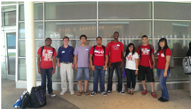
UH Facilitators (Undergraduate and Graduate students)

We have UH undergraduates and graduate students serve as facilitators that help when students break into groups