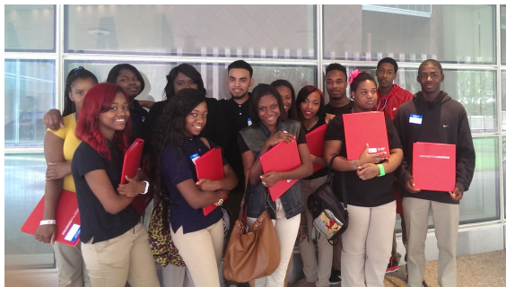
High School Students from Hope Academy

Each Monday we bring approximately 15 high school students from Hope Academy to UH for a 2-hour math lesson